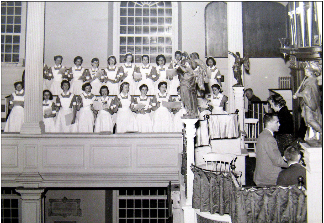
Happy Holidays! Christmas Concert, Old North Church, about 1960